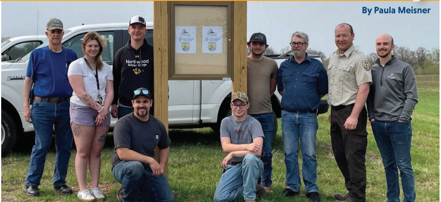
2022 Advanced Communications class standing in front of one of the grant funded informational kiosks