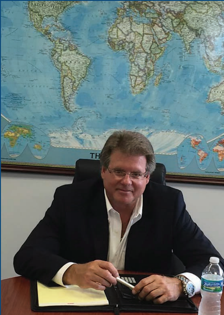
Graduate Automated Packaging Systems Technician Program