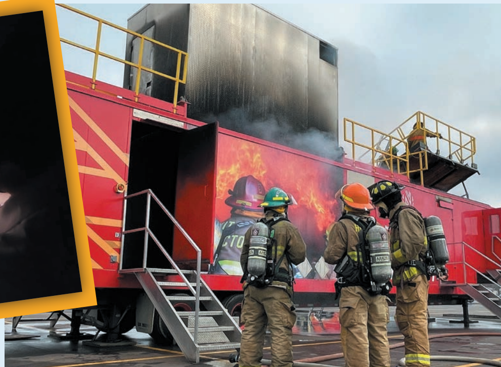
The firefighting and technical rescue program simulates real-life experiences with a mobile burn trailer, providing training across the District.