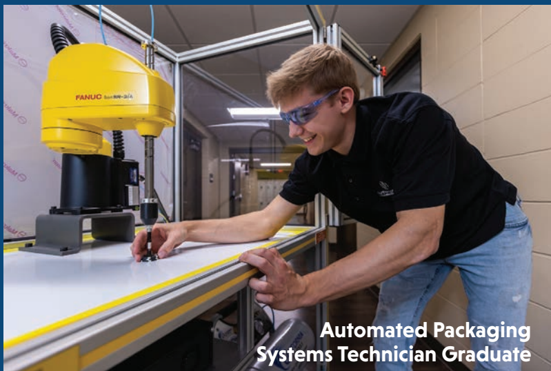
Automated Packaging Systems Technician Graduate

"Automation is coming into everything. Manufacturing lines are turning into all robots and machines that do it for them. I'll be the guy who can fix the robots instead of being replaced by them. It's turned me into someone who looks at everything as, I can now do it, instead of saying, that looks hard, I'm not going to do it. My favorite skill was taking a machine and dissecting it to where you can understand it. That's one of the biggest things now in my everyday life. I look at everything and say, if it's broken, how can we dissect it and fix it. That's huge. In my job here in assembly, I get to be creative all the time."