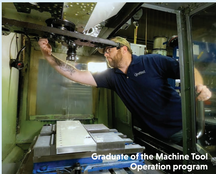
Graduate of the Machine Tool Operation program

"I got out of the Army and all I wanted to do was find a job that was going to pay for the bills that my family needed to pay for and I looked around, saw the program Northwood Tech offered and realized it was wonderful for a person like me. I like building things. I like working with my hands. I'm a machinist, and I run a VF2. I make any and all parts they send my way. We had a great instructor who has actually worked here before, so we knew exactly what to expect when we walked in and the knowledge that he covered was extremely comprehensive. I love working here. I come in every day, and I never know what's going to come across my desk. Sometimes it's challenging, sometimes it's easy. It's never the same thing every day. The precision that we can do in this shop is mind blowing. The money is great; the work is fun. I make something here that lasts."