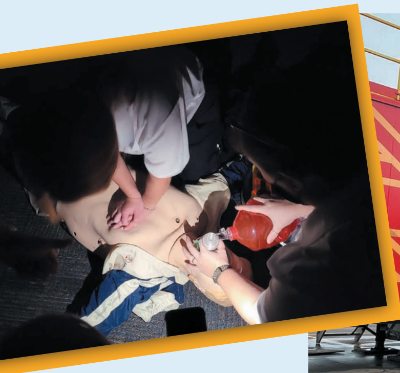
EMS training simulates real-life emergency situations utilizing medical devices on hand and cell phones to create light.