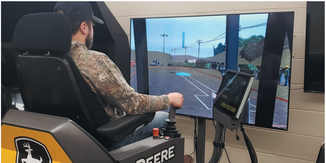
Utility construction technician students practice controlled, precise digging using an excavator simulator.