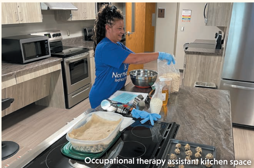
Occupational therapy assistant kitchen space

With all of the simulation technology in one location, the College is only required to purchase and maintain one set of simulation equipment and technology, which is a cost savings, but also allows the College to better provide students with latest innovative equipment and dedicated staff.