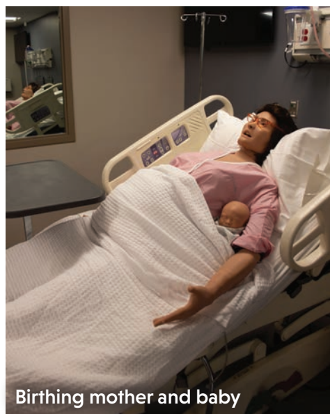
Birthing mother and baby

Northwood Technical College is leading the charge in innovative healthcare training and simulation with a new Health Education Center that opened at the start of the Fall 2022 term. The renovated building,