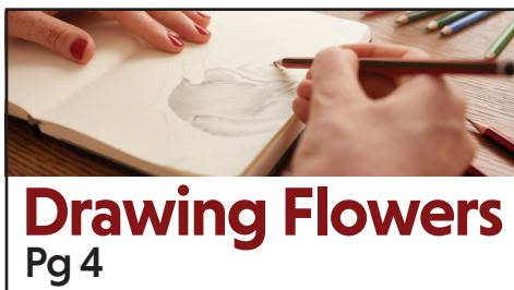
Drawing Flowers Pg 4