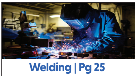
Welding | Pg 25