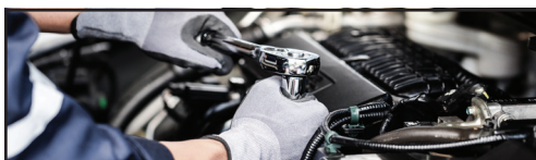
Auto Mechanics for Mechanics | Pg 18

N/A Start dates vary $115 Online Ed2GoStaff