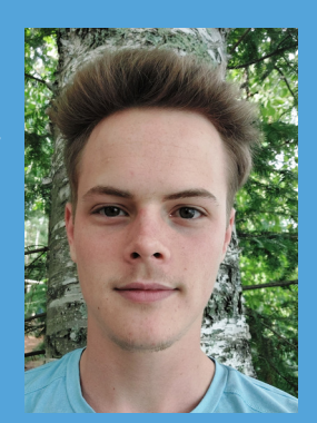
Spring 2023 scholarship recipient,

"Thank you for the extra support with a [$25] gas card. This is such a helpful resource and a huge blessing for someone like me with limited income on social security disability. This took stress off of me driving 89 miles round trip for school. I wish I could do more than just a thank you, truly.